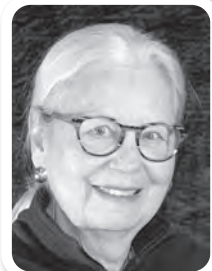
Jean de Cartier Properties