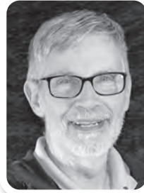
Paul Hilton Lighting Design