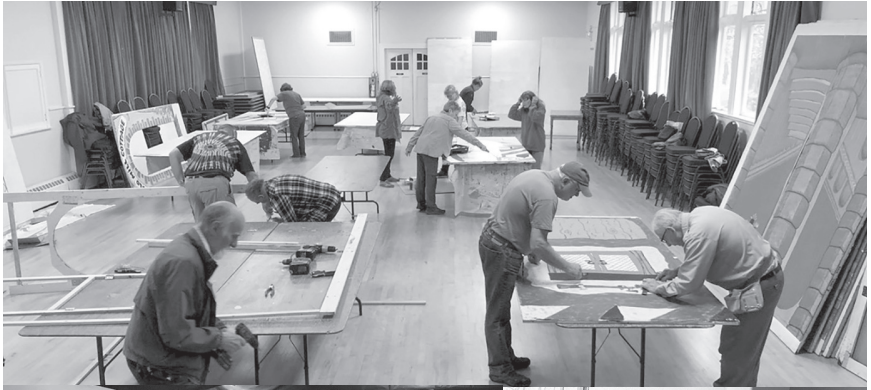
Some of our wonderful volunteers caught in the act of set construction and painting.