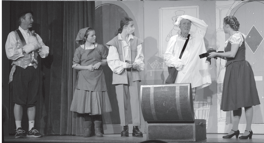
Music, stage and 1st dress rehearsals.