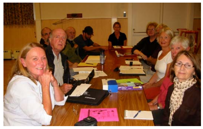
A recent Production meeting for Arsenic and Old Lace

Audiences are sure to enjoy this farcical black comedy that "kicks off" St Luke's Players 2010/2011 Season. Tickets go on sale on September 11 for the 11 performances, including 3 matinees. Don't miss it - ensure that you buy your tickets as soon as you can!!