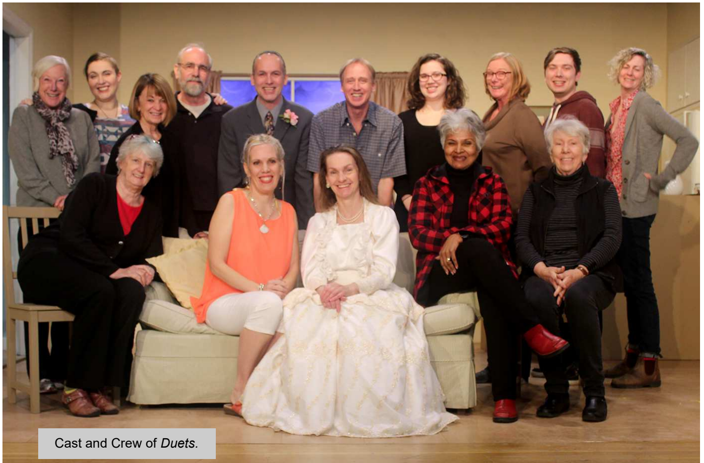
Cast and Crew of Duets .