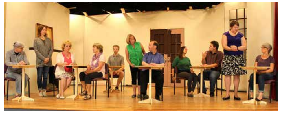
Rehearsing for Table Number 7