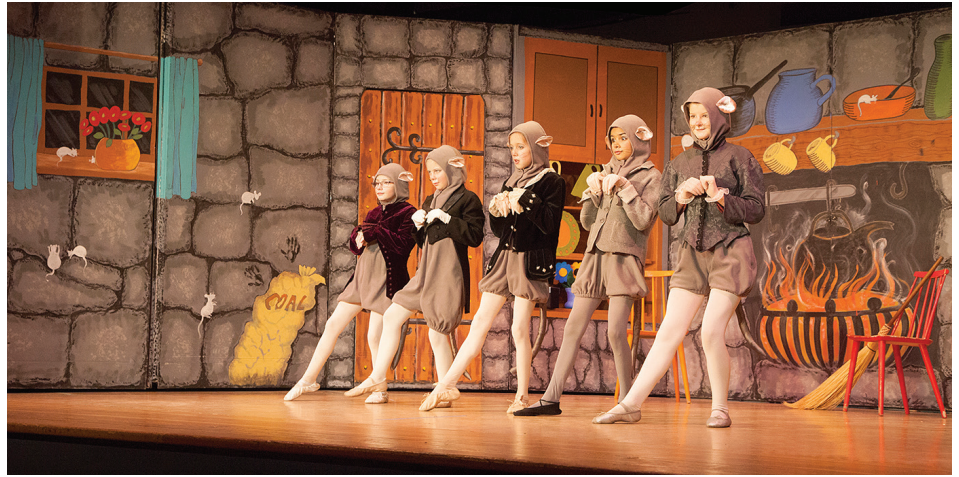
Adorable mice, some not so adorable stepsisters and a telling moment in Cinderella.