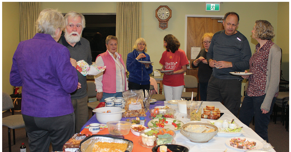
Some of the cast and crew of Bedtime Stories noshing at the 'Meet & Greet'

Come and see " Bedtime Stories " March 7 to 18th – you won't be disappointed.