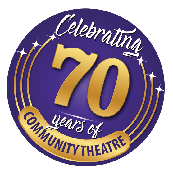
Season 32, May 1981 The Curious Savage

It's amounted to $200 000 over the past dozen years. Of course, it hasn't always been easy. One year two members had to loan $$ to the Players so that we could present a play. Another year an arrangement had to be made for the Treasurer to pay back "borrowed" funds. We are pleased that our concession prices, set 10 years ago have remained inexpensive, and we still make a small profit.