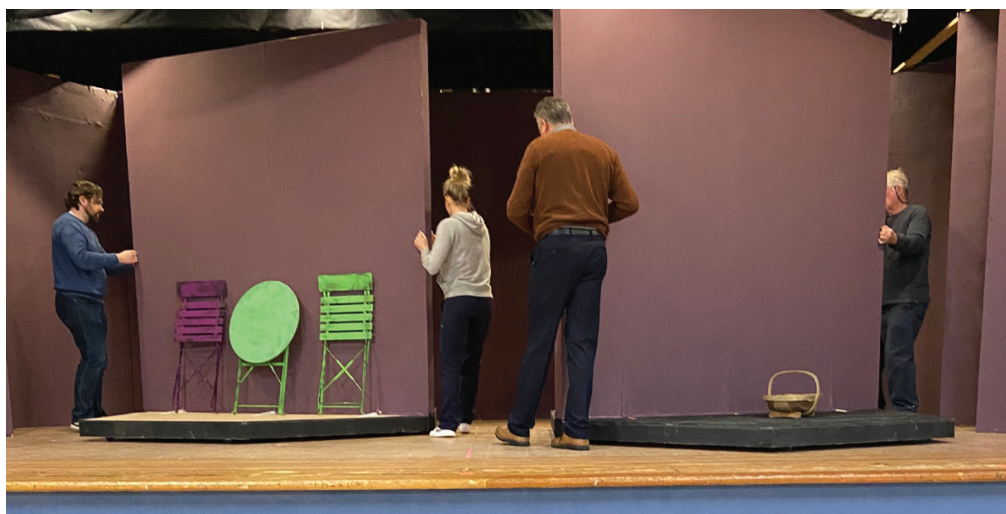
Cast and crew of I Never Sang for My Father practicing turning the 'revolves'

Tom Thomson, Canada's most iconic painter who died mysteriously at the height of his power in 1917. The play explores the role of the creative artist in times of war and social unrest. Monday, April 20th at 8pm.