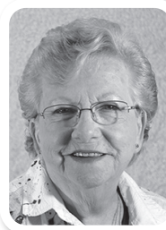
De Roger Set Décor & Painting