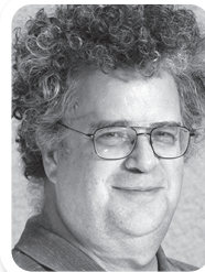
David Fenger Lighting Design