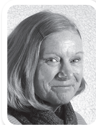
Deb Taylor Properties