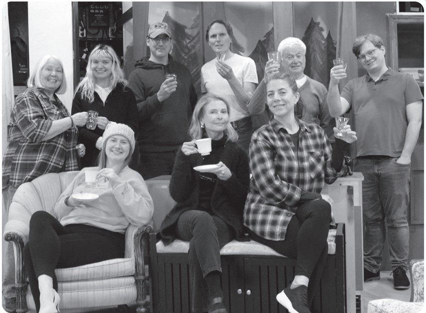
The fun-loving cast toasting themselves at rehearsal