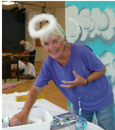
Set construction is under way, and looking good.