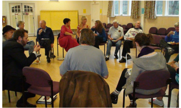
Cast and crew get to know each other during the Meet & Greet.

The first footsteps of staging have been completed and everyone is well on their way to becoming their stage personae. The set is mostly up and looking great. All in all, it's been a fun affair with old friends reminiscing, new friends being welcomed, and we can look forward to a suspenseful and hilarious show.