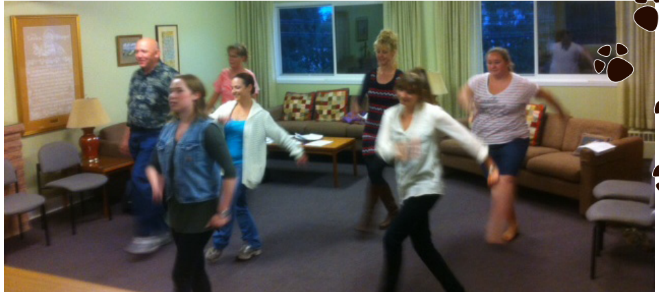
Potential panto participants get put through their paces for parts.