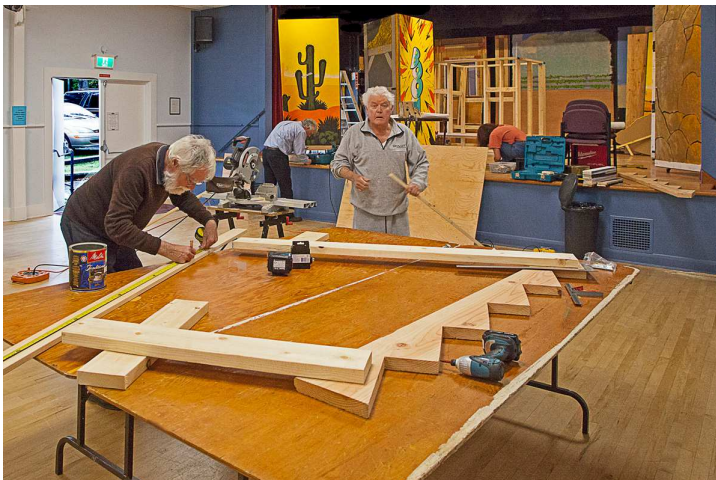
Constructing Mother Goose's boot for the set