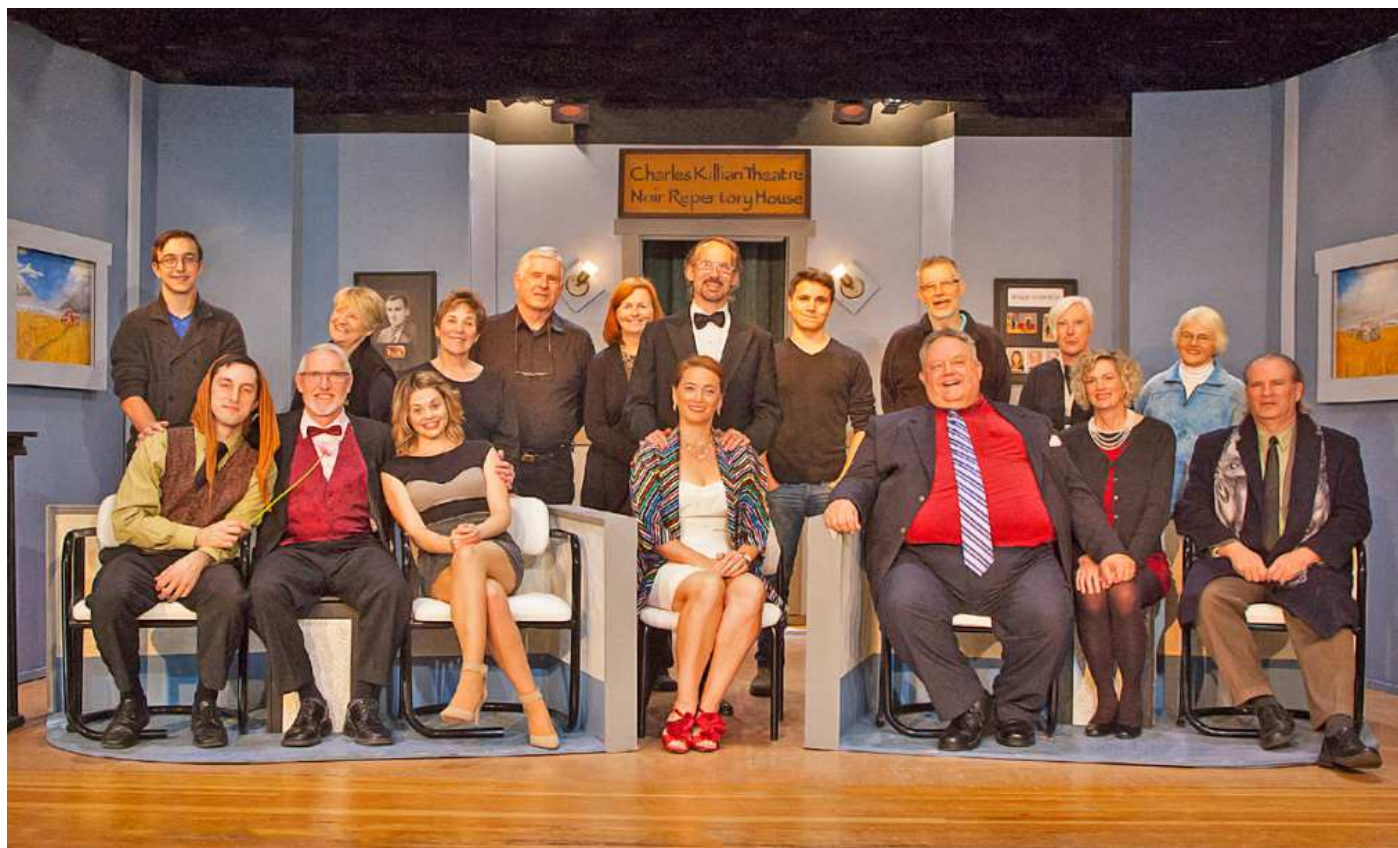
Cast and Crew

Refer to St. Luke's Players' website for more information on upcoming plays and to look at photos of your favourite productions from the past.