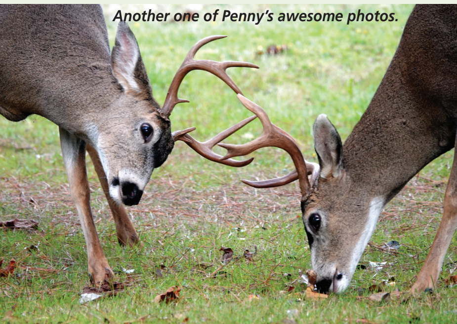
Another one of Penny's awesome photos.

■ Until the Flood starts its run at Bema Dec 2 — co-production with Attitude Theatre and Langham with tickets available at langhamcourttheatresociety.thundertix.com ■