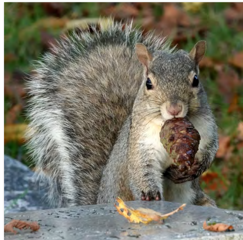
Penny Pitcher caught this chubby squirrel eating breakfast.