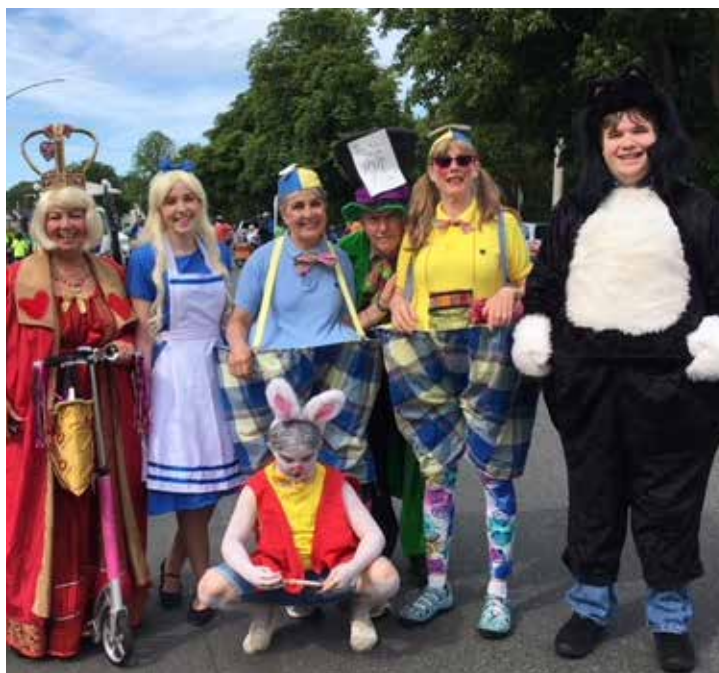
THE WONDERLAND GANG 2019