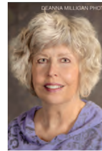
The Black Rider – The Casting of the Magic Bullets, Theatre Inconnu Black Rider

with Cats to set dressing for Visiting Mr. Green running at BEMA from Nov. 23rd to Dec. 4th. ■