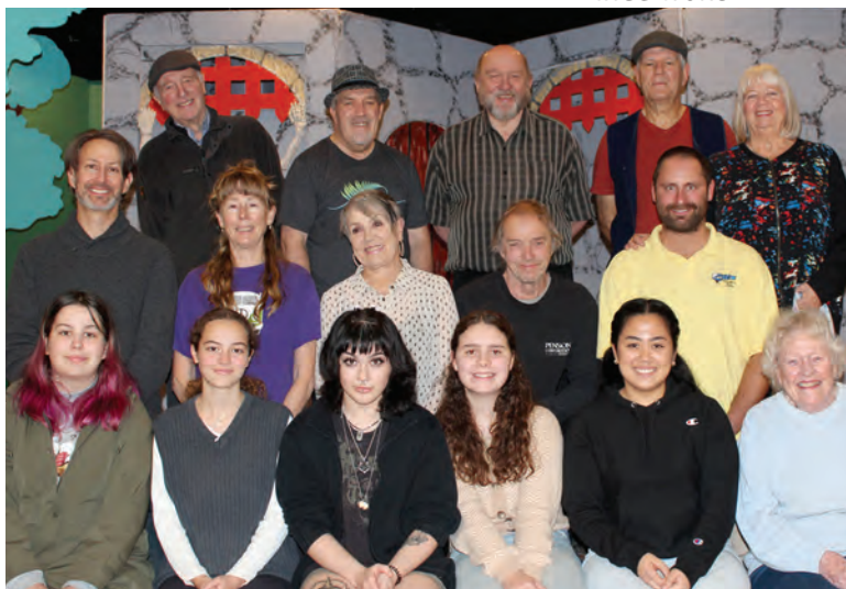
The cast of Robin Hood and the Babes in the Wood