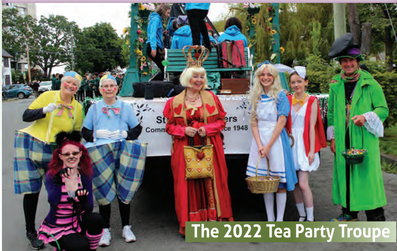
The 2022 Tea Party Troupe

SLPCT usually has a fun-loving group dress up and circulate around along the parade route. We wave and greet the onlookers while identifying ourselves as St. Luke's Players Community Theatre and handing out brochures and the supplied treats. Contact us if you'd like to come out and play!