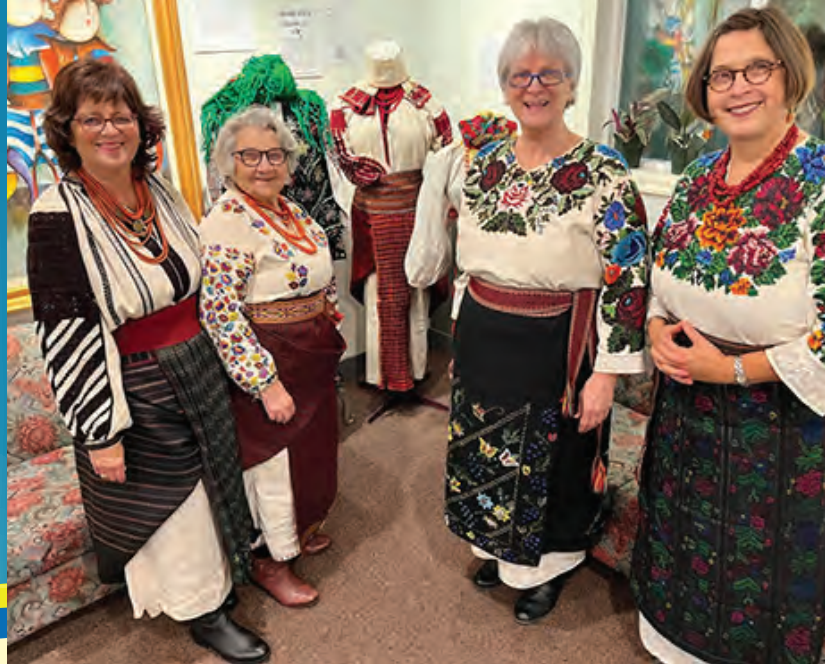
This is a photo of LUNA Ukrainian Ensemble at a fundraising event that Langham Court Theatre hosted in February called hearts and Hustkas. We featured the story of the Kokum scarves.